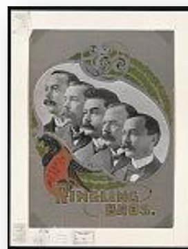
Circus poster showing a photograph of five brothers.

Ringling Bros. , 1900. Buffalo: Courier Litho. Co. Photograph. https://www.loc.gov/item/2019635344/ .