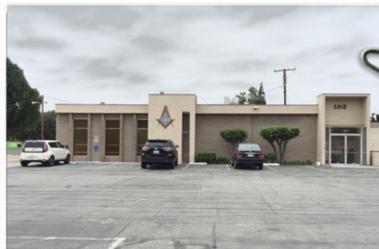
Lakewood Masonic Center Hall