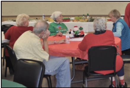
Pot Luck Conversations