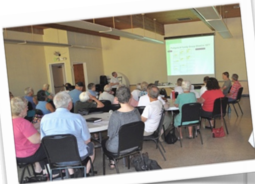
First Meeting at Our New Facility