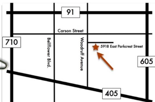
5918 E. Parkcrest Street