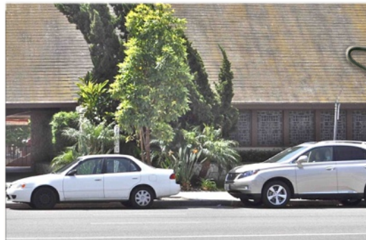
Los Altos United Methodist Church Chapel