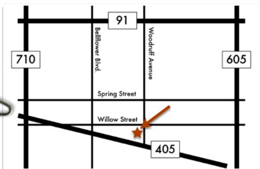
5950 E. Willow Street, Long Beach