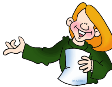
FIRST VICE PRESIDENT