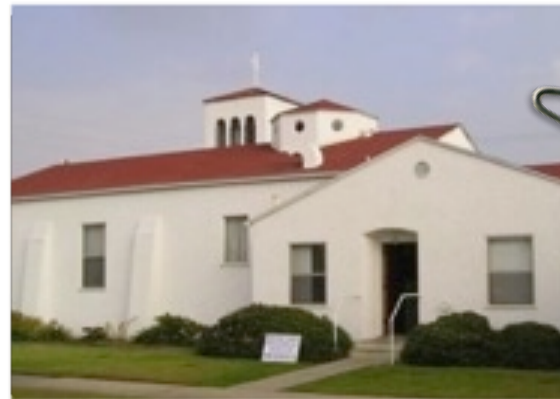
Resurrection Lutheran Church Parish Hall