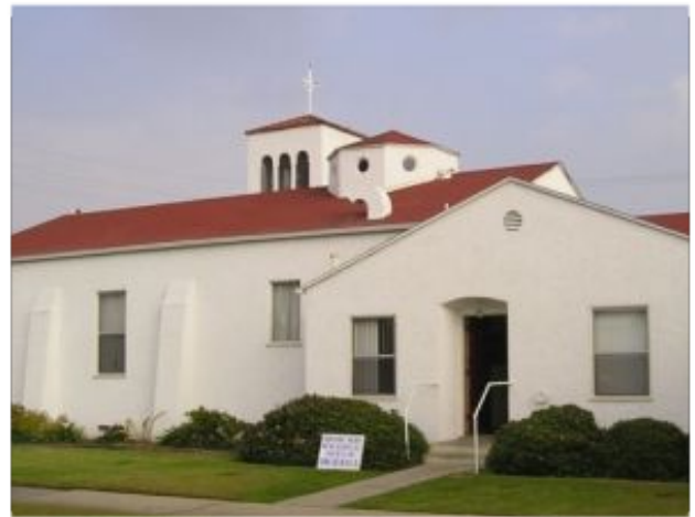
side entrance to the parish hall