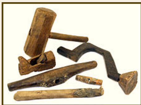
Carpenter's Tools 1600

Many people illustrate the records of their pre-1850 ancestors with copies of documents that they have found: baptismal records, death registers and marriage certificates. We all tend to avoid using photographs, paintings and illustrations that we find on the internet because we know that they might be