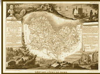
1852 map of Brittany