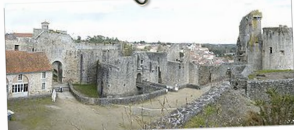
Clisson, Brittany, France