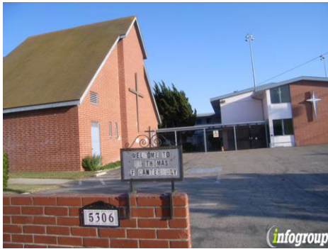
St. Thomas of Canterbury 5306 E. Arbor Rd. Long Beach, CA